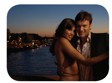
FUJIFILM SR AUTO

Available in all FinePix digital cameras that do not contain EXR Technology.