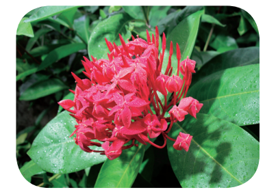
FUJIFILM SR AUTO