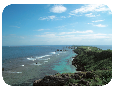
FUJIFILM SR AUTO

When SR AUTO detects a landscape, it automatically optimizes for maximum sharpness and depth of field. From cityscapes to nature, landscapes are captured in beautiful, high-resolution color and smooth tonality, just as the human eye sees them.